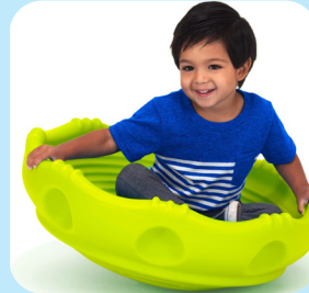
Wobble disk and climbing dome