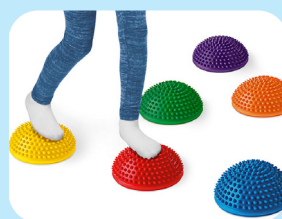
Step and balance sensory stones