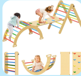
Wooden indoor climbing set

The room's walls will be painted, including this mural. Padded carpet will also be installed.