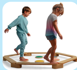
Wood balance beam